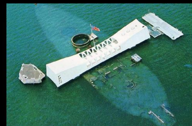
To the memory of the gallant men here entombed and their shipmates who gave their lives in action on December 7, 1941 on the USS Arizona