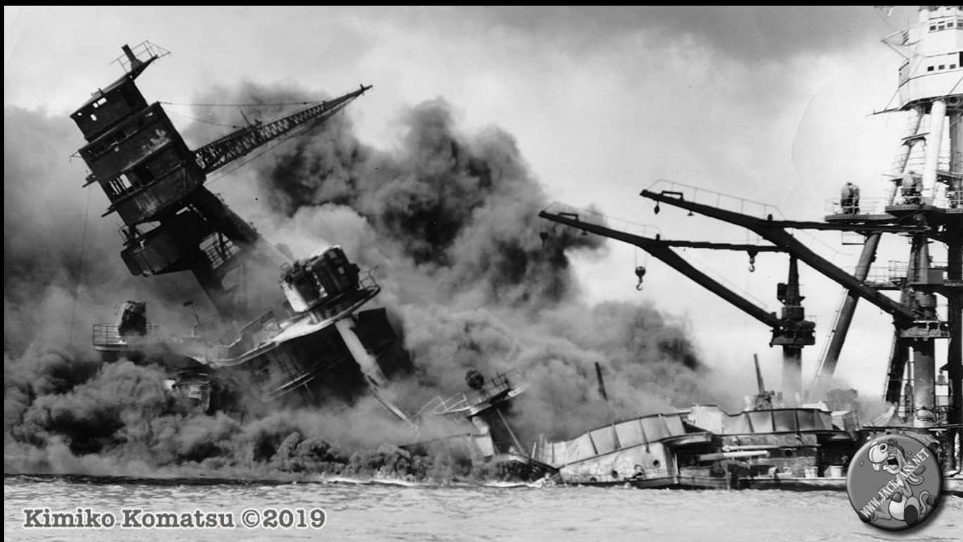
Kimiko Komatsu ©2019